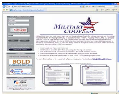
Web-based / Password Protected